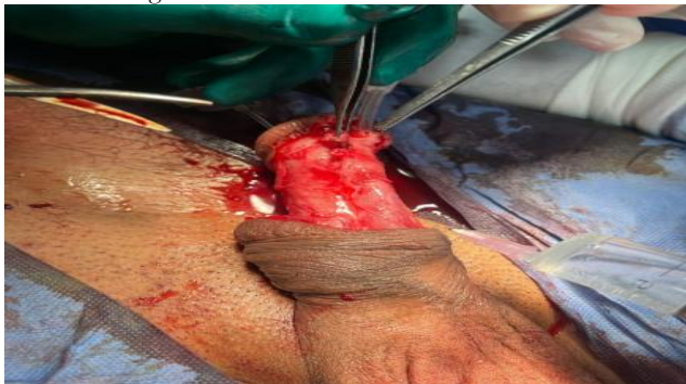
Figure 2: Complete degloving of penis to release fibrous bands before scrotal implantation.

The next step was to create an intrascrotal tunnel connecting the skin and dartos layer by making a transverse incision in the lower part of the scrotum. It was necessary to implant the penis beneath the scrotal skin before its extraction via the distal tunnel hole. The penile skin was sutured to the scrotal skin at both scrotal openings to prevent penile rotation "Figure 2 & 3".