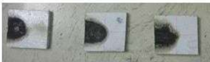
10% Tartaric Acid 10% Ammonium Phosphate 10% Nano Silica Fig 1.3 Char Formation

To determine the level of char formation on the wood specimen, visual observation has been done.