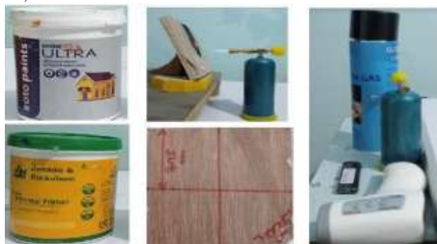
Fig 1.2 DIY Experiment Resources