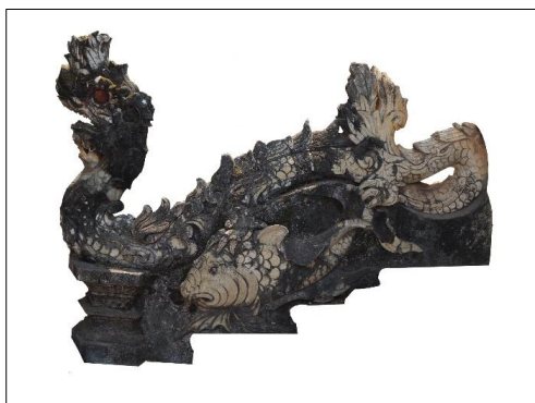
Figure 5: Makara discharging naga (serpent-eating dragon)