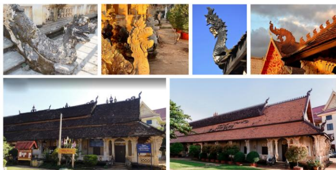
Figure 3: Post-Restoration Condition of the Monastic College at Wat Luang Pakse (Wat Pho Rattanasadaram, Pakse)

From the field survey, it was found that the current restoration of the monastic college is being undertaken because the building's structure can no longer support the weight of the roof. However, rather than preserving the original architectural features, the restoration has been directed towards a 'renewed modernization,' possibly due to various factors that influence the approach to restoration. These factors may not align with traditional conservation principles or international standards, which emphasize the preservation of a site's original identity. Interviews with resident monks further revealed that the restoration is being carried out independently by the temple community due to a lack of funding. Unfortunately, without the intervention or support from any responsible agencies, this significant cultural site may eventually be reduced to a deteriorating structure on the brink of collapse.