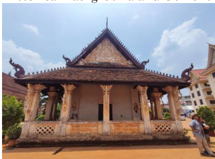
Figure 1: The Buddhist College at Wat Luang Pakse

Historical Background and Current Condition of Wat Luang Pakse (Wat Pho Rattanasadaram), Lao PDR