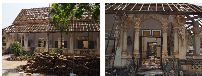
Figure 2: The Buddhist College of Wat Luang Pakse, or Wat Pho Rattanasadaram Pakse, during its restoration.

To be entombed at this temple—where remains are stored in stupas (locally known as "That") —one must have been a person of high status, a wealthy individual, or a distinguished public figure . Several members of the Champasak royal lineage have stupas at this temple. Notably, Thao Katai Don Sasorith , a former Prime Minister of Laos under the conservative government before the communist revolution, has the most prominent and grand stupa standing directly in front of the ordination hall . This elaborate structure serves as a testament to his importance in Laotian history and politics (Pattaya Chandakun, 2017).