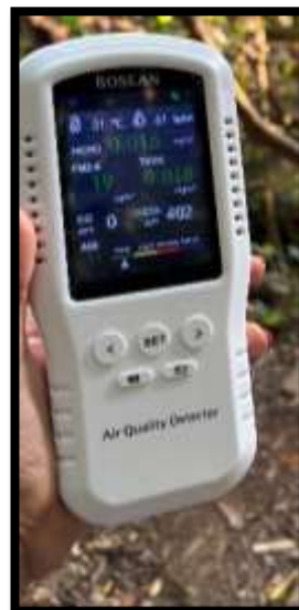
Fig.2 T-Z01 air quality monitor

The temperature and humidity were measured using a device that measures the air quality index. The T-Z01 air quality monitor is a high-performance device designed to assess home air quality by measuring concentrations of PM2.5, HCHO, TVOC, CO, CO 2 , as well as temperature and humidity levels.