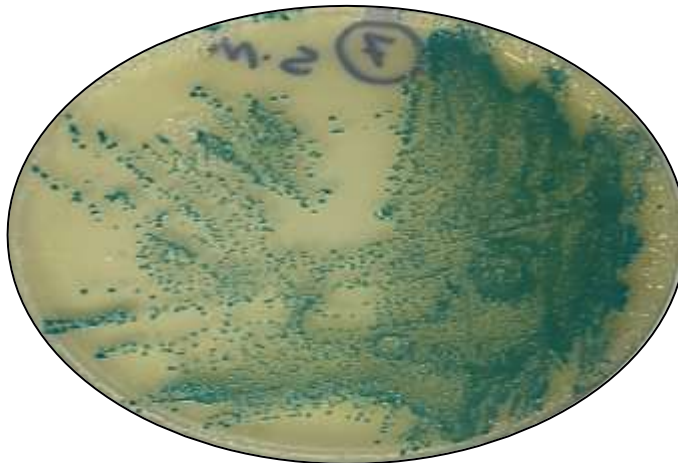
(Figure 1): Methicillin-Resistant Staphylococcus aureus (MRSA) on HiCrome MeReSa Agar Base medium lrmr7rrrrrrro cvd54