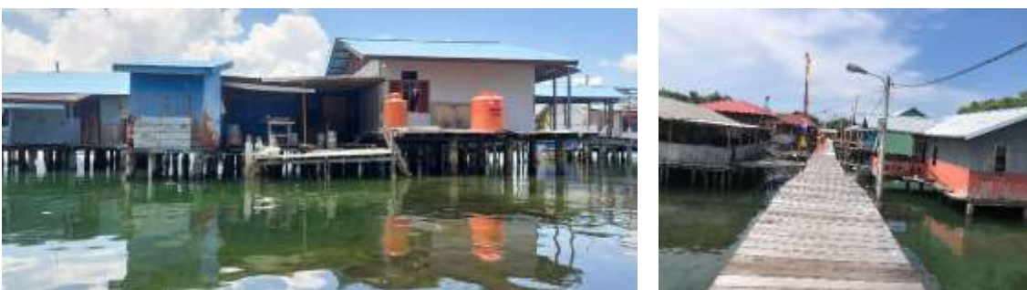
Figure 3. Existing settlements above the water in Tobati Village

1) Key Characteristics. The Tobati Village water settlement is a traditional area deeply tied to the coastal ecosystem and socio-customary order. Its main characteristics are evident in the connection of community life practices to ecological (especially mangrove) and socio-cultural conditions: there is a tradition of "women's forests" and customary prohibitions on the use of marine resources; air quality is relatively good; local materials are used in house construction; and women play a role in the household economy. On the other hand, clean water distribution is uneven, sanitation is inadequate, and environmentally friendly technologies have not been implemented, thus remaining a challenge to ecological sustainability. From a socio-economic perspective, the community remains dependent on marine resources through a diversification of jobs (fishermen, sea taxis, craftsmen, tourism businesses), supported by social capital (mutual cooperation, religious activities), and the role of traditional leaders and village heads. However, participation in planning is uneven, cooperatives/local economic institutions do not exist, and traditional knowledge has not been systematically documented. Customary institutions are recognized and functioning, but have not been fully integrated into formal laws and spatial planning policies, so management strategies need to be holistic-participatory, based on local wisdom, and adaptive to environmental and climate change.