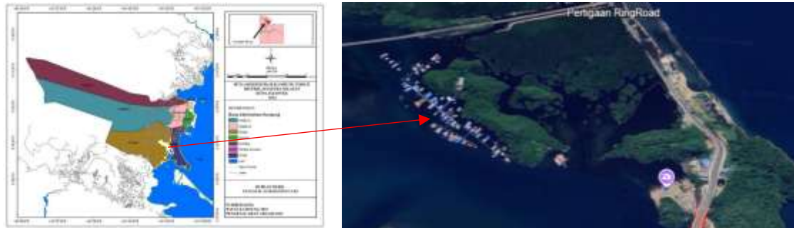
Figure 2. Administrative Map of Tobati Village

The location of this research is in the Tobati Village settlement, which is located in the Youtefa Bay area, Jayapura City, Papua Province.