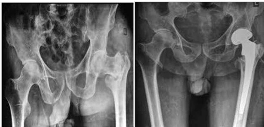
Figure 2: Pre-op x-ray: immediate post op x-ray