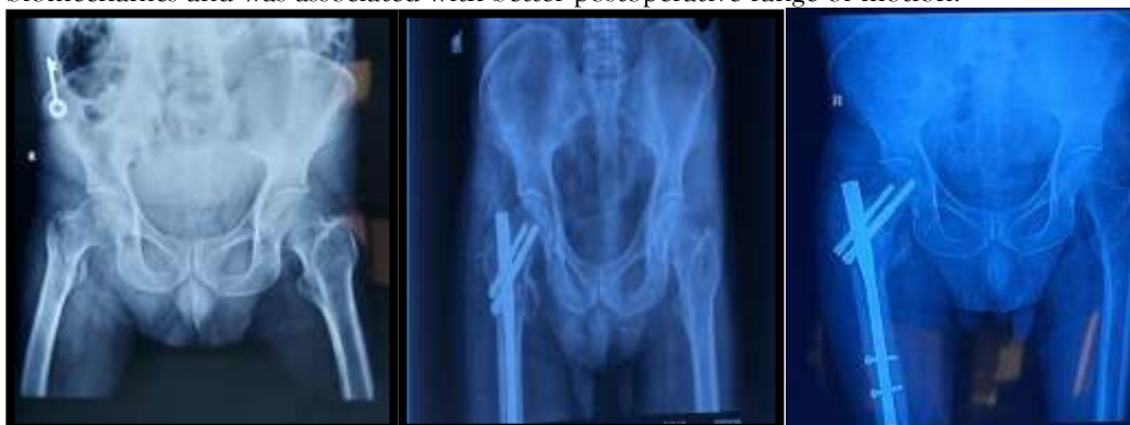
Figure 1: Pre-op x-ray: immediate post op x-ray: x-rays 6 months follow-up

Overall, both PFN and bipolar hemiarthroplasty demonstrated good functional outcomes for comminuted intertrochanteric fractures. Hemiarthroplasty allowed earlier mobilization, whereas PFN preserved hip biomechanics and was associated with better postoperative range of motion.